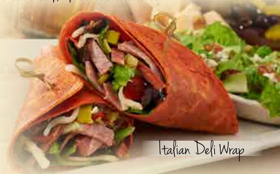
Italian Deli Wrap

Capicola and Salami with Provolone and Olive Pepper Relish